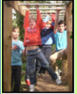
Woodland adventure trail