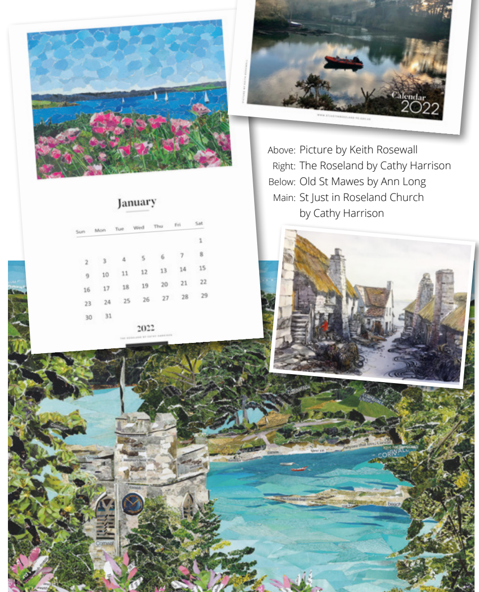
Above: Right: The Roseland Below: Old St Mawes Main: St Just in Roseland Church

You can purchase our Calendar for 2022 which features many of our local artists work from the Roseland Visitor Centre